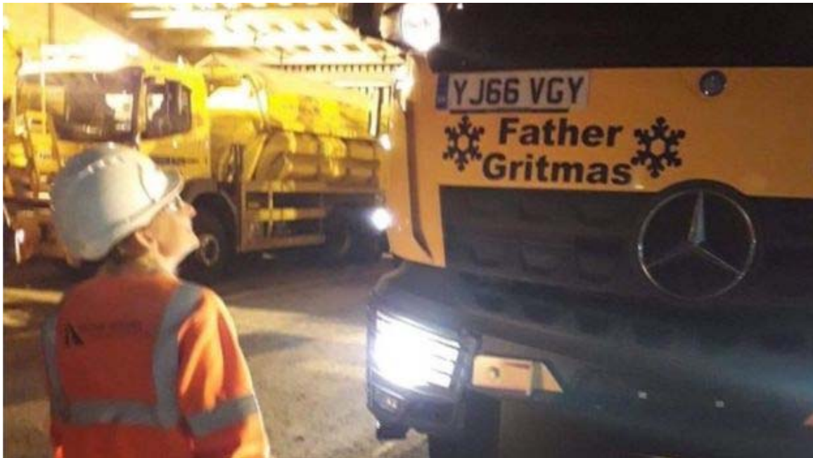
Image caption The names will be displayed on the front and sides the cab of each gritter

SprEd Sheeran will patrol around Framlingham, the town where singer Ed Sheeran is from. Grit Rhys Jones will be designated to the Shotley patch, on the peninsula where comedian and actor Griff Rhys Jones has a home. One called Benjamin Gritten will circulate around the Leiston area in honour of the Lowestoft-born composer Benjamin Britten, who lived in nearby Aldeburgh.